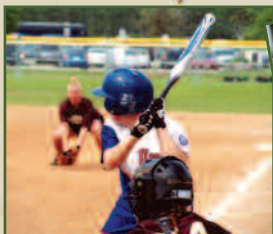
"Go ahead, take a swing"

The Osceola County Stadium delivers the ideal combination of excitement, convenience and superb facilities. The complex recently underwent an $18.4-million renovation improving comfort and adding state-of-the-art amenities. Truly a major league operation, this facility hosts the National League Houston Astros for spring training. The Stadium is also host for a number of baseball tournaments, clinics, and other events. Situated in the heart of the Kissimmee area, the Stadium is easily accessible by major traffic arteries and is convenient to the Walt Disney World Resort and other area attractions.