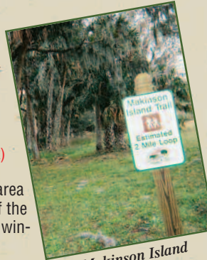
"Makinson Island Loop Trail"