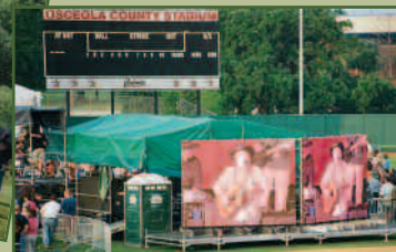
"Willie Nelson in Concert"