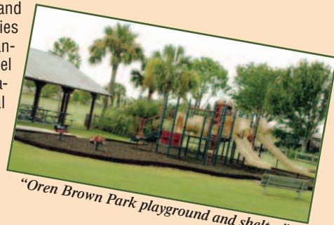
"Oren Brown Park playground and shelter"

Oren Brown Community Park located on the south end of Kissimmee off Baker Drive is a great facility for sporting events and practices. It offers soccer and youth softball fields along with a playground and picnic facilities and hosts the annual Rebel Games Tournament and local leagues.