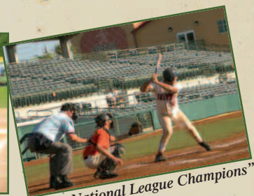
"2005 National League Champions"