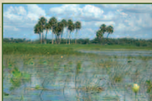
"Water Lilies on Lake Toho"

Osceola County Parks Division is home to over 40 parks and facilities throughout the county. You will find we offer a wide assortment of amenities to better the lives of our residents. Our parks range in size from small neighborhood parks to our larger regional parks to suit the needs of the community.