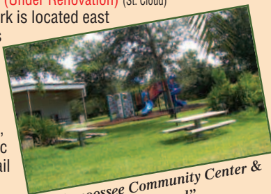
"Narcoossee Community Center & Playground"

Hickory Tree Community Park is located east of St. Cloud. This facility offers four practice fields, a concession stand and restrooms. Future park renovations include the renovation of existing football fields to multipurpose turf fields, new parking, playground, picnic pavilion and perimeter walking trail around the park.