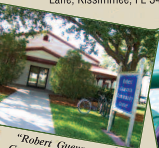
"Robert Guevara Community Center"

Osceola Heritage Park/Silver Spurs Arena: 1875 Silver Spurs Lane, Kissimmee, FL 34744, 321-697-3333.