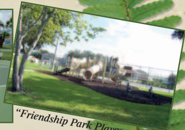
"Friendship Park Playground"