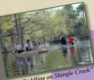
“Paddling on Shingle Creek”