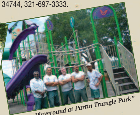
"New Playground at Partin Triangle Park"