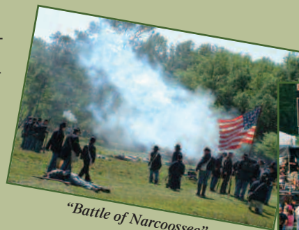
"Battle of Narcoossee"