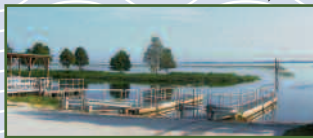
"Southport Park Boat Ramp"

40 Smith's Landing Ramp - Access to Lake Gentry