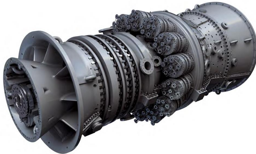
Figure 2-2 An example of a General Electric 7F.05 CT engine similar to the ones proposed

A simple-cycle CT works by igniting a mixture of compressed air and fuel inside its combustion chambers. The resulting hot air is forced through the turbine, rotating its drive shaft at 3600 revolutions per minute (RPM), which then turns an attached electric generator to produce