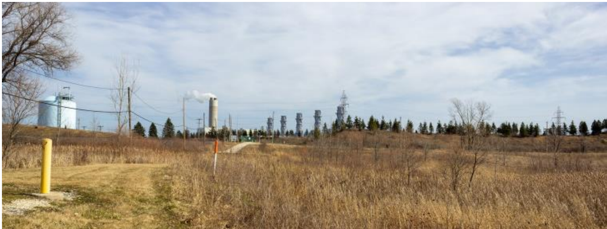
Figure 3-1 Photo simulation of the project constructed on the Proposed Site from Elm Road

The applicant provided simulations of what the CT facility would look like in photo simulations of the facility from outside the OCGS property in Volume I Appendix Z of the application. Images from this appendix are shown in Figure 3-1 and Figure 3-2 to provide views of the proposed project as it would appear when constructed. Generally, the aesthetic impacts are not anticipated to be a significant impact to the environment, as they are not being introduced to a neighborhood or community for the first time, since there already is an existing facility, and cumulatively do not substantially change the views into the OCGS property.